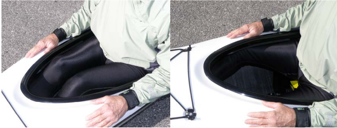
Photo 3. X-Series -- knees/legs comfortably centered in cockpit