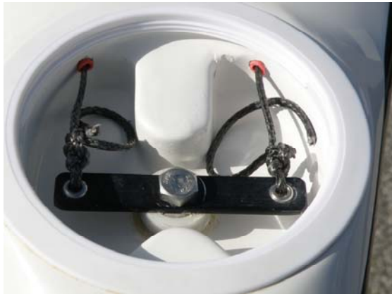
Photo 9. X-Series -- spreader bar and pedal lines

bar. It's that easy! This method can be used anytime you want to make pedal adjustments and/or fine tune the rudder alignment. Be sure to replace the rudder access cover and hand tighten in a clockwise direction.