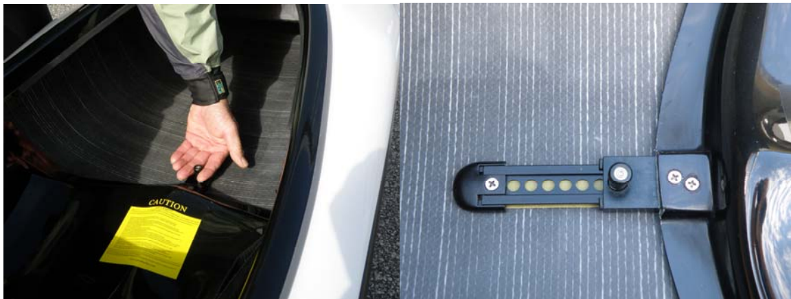
Photo 1. X-Series -- to adjust seat, pull up on release button