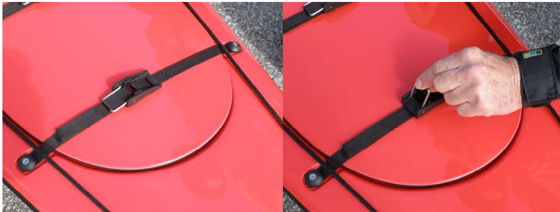
Photo 7. GPX -- hatch strap tightened with metal cam lever locked down