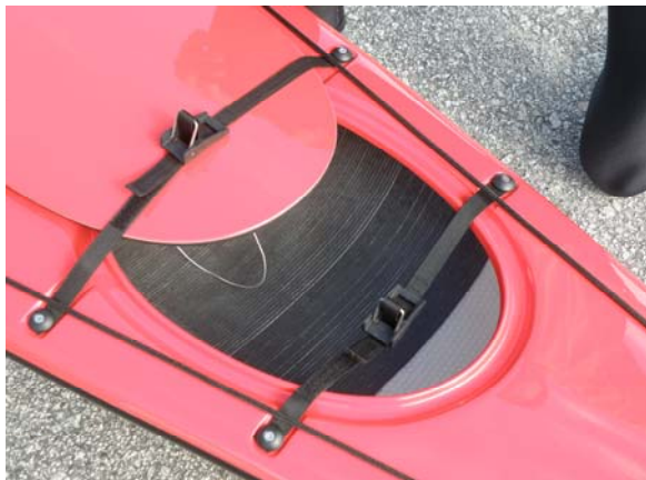
Photo 9. GPX -- levers open, Velcro®/straps loosened, hatch cover removed