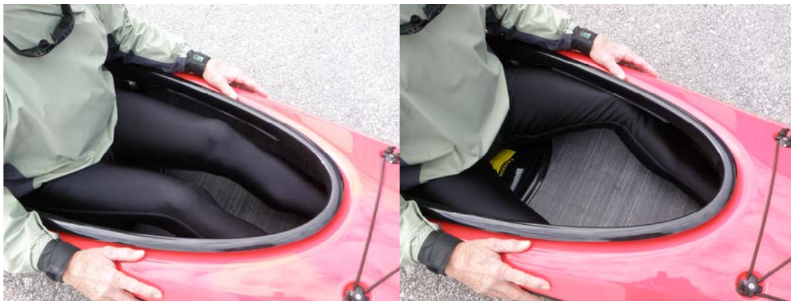
Photo 1. GPX -- knees/legs comfortably centered

The need for a firm connection to your kayak has not been overlooked! The GPX cockpit design incorporates integrated thigh braces molded under the deck. Molded, rather than “wing-style”, thigh braces leave space for freedom of movement and will allow you to easily slide your legs under the thigh braces for a solid connection when you want one -- such as in rough water conditions, rolling, bracing or any other time you desire (photo 2). Look forward to many safe and comfortable hours in your GPX with Epic's unique and thoughtful cockpit design!